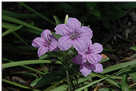
Hairy Wild Petunia flowers