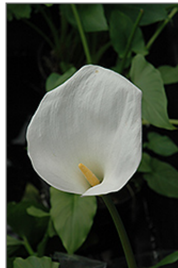
Calla Lily flowers

Calla Lily is recommended for the following landscape applications;