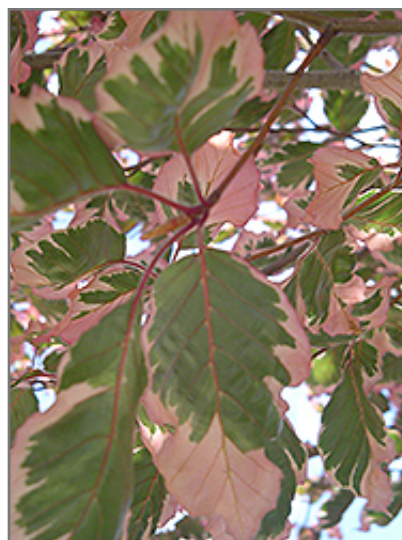
Tricolor Beech foliage