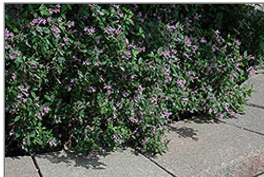
Leptodermis in bloom

This shrub does best in full sun to partial shade. It prefers to grow in average to moist conditions, and shouldn't be allowed to dry out. It is not particular as to soil type or pH. It is somewhat tolerant of urban pollution. This species is not originally from North America.