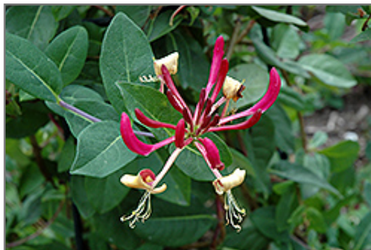
Peaches And Cream Honeysuckle flowers

This woody vine will require occasional maintenance and upkeep, and is best pruned in late winter once the threat of extreme cold has passed. It is a good choice for attracting butterflies and hummingbirds to your yard. It has no significant negative characteristics.