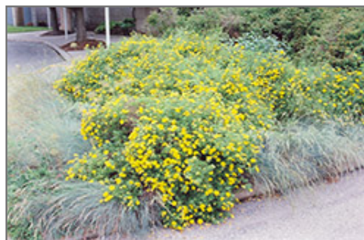
Goldfinger Potentilla in bloom