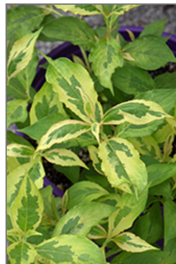
My Monet Sunset Weigela foliage

My Monet Sunset Weigela is recommended for the following landscape applications;