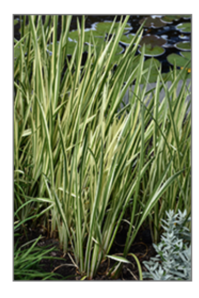
Variegated Sweet Flag

Variegated Sweet Flag is recommended for the following landscape applications;