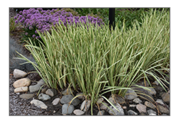
Variegated Sweet Flag