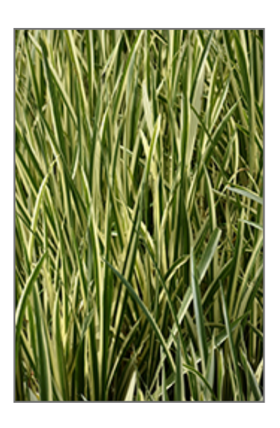
Variegated Sweet Flag foliage

This plant does best in full sun to partial shade. It prefers to grow in moist to wet soil, and will even tolerate some standing water. It is not particular as to soil pH, but grows best in rich soils. It is somewhat tolerant of urban pollution. This is a selected variety of a species not originally from North America. It can be propagated by division; however, as a cultivated variety, be aware that it may be subject to certain restrictions or prohibitions on propagation.