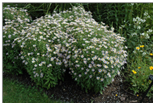
Blue Star Japanese Aster in bloom