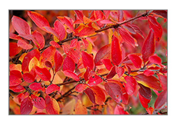
Hedge Cotoneaster in fall