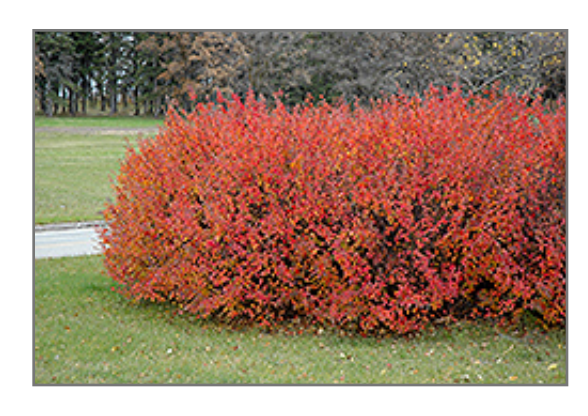
Hedge Cotoneaster in fall

This shrub does best in full sun to partial shade. It is very adaptable to both dry and moist locations, and should do just fine under average home landscape conditions. It is not particular as to soil type or pH, and is able to handle environmental salt. It is highly tolerant of urban pollution and will even thrive in inner city environments. This species is not originally from North America.