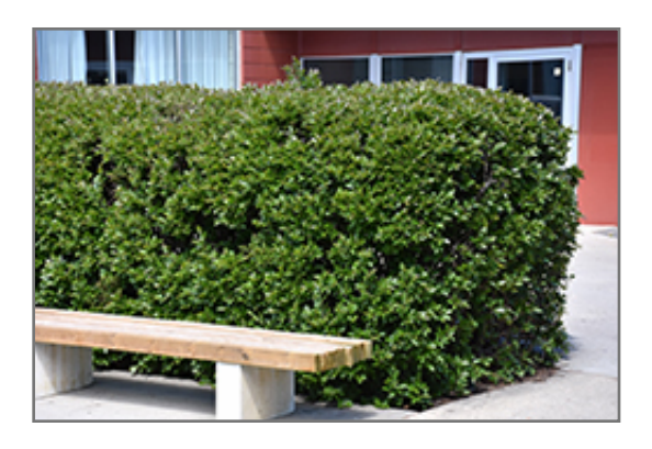
Hedge Cotoneaster

Hedge Cotoneaster is recommended for the following landscape applications;