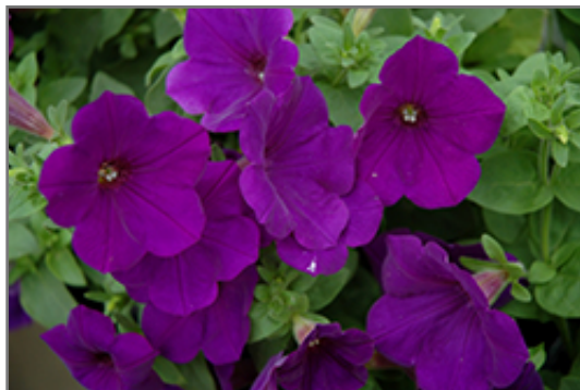
Supertunia Royal Velvet Petunia flowers

Supertunia Royal Velvet Petunia is recommended for the following landscape applications;