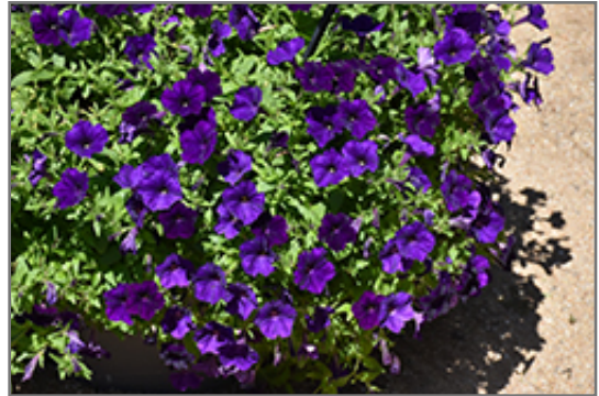
Supertunia Royal Velvet Petunia flowers

Supertunia Royal Velvet Petunia will grow to be about 10 inches tall at maturity, with a spread of 24 inches. When grown in masses or used as a bedding plant, individual plants should be spaced approximately 20 inches apart. Its foliage tends to remain low and dense right to the ground. This fast-growing annual will normally live for one full growing season, needing replacement the following year.