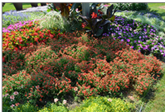
Sunsatia Cranberry Nemesia in bloom