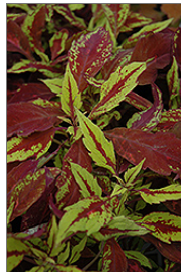
Pineapple Coleus foliage