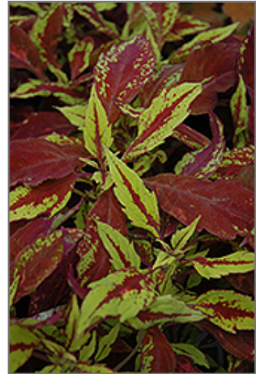
Pineapple Coleus foliage