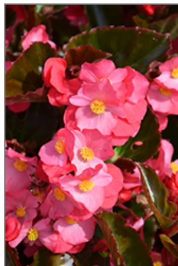
Big Rose Bronze Leaf Begonia flowers