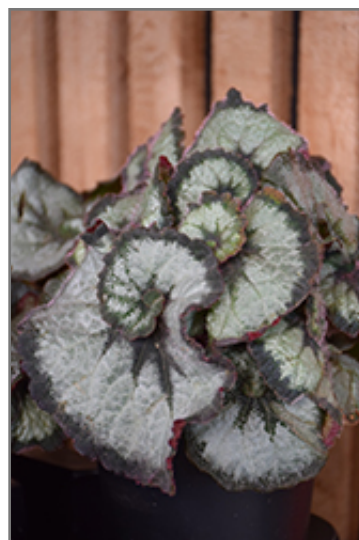
Escargot Begonia foliage