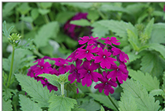
Superbena Purple Verbena flowers

Superbena Purple Verbena is recommended for the following landscape applications;