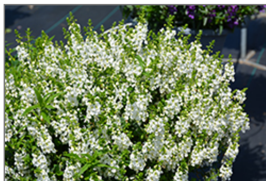
Serena White Angelonia in bloom