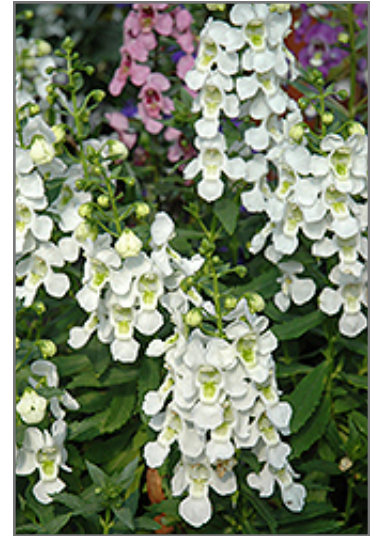
Serena White Angelonia flowers

Serena White Angelonia is a fine choice for the garden, but it is also a good selection for planting in outdoor containers and hanging baskets. With its upright habit of growth, it is best suited for use as a 'thriller' in the 'spiller-thriller-filler' container combination; plant it near the center of the pot, surrounded by smaller plants and those that spill over the edges. Note that when growing plants in outdoor containers and baskets, they may require more frequent waterings than they would in the yard or garden.