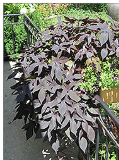
Proven Accents Blackie Sweet Potato Vine