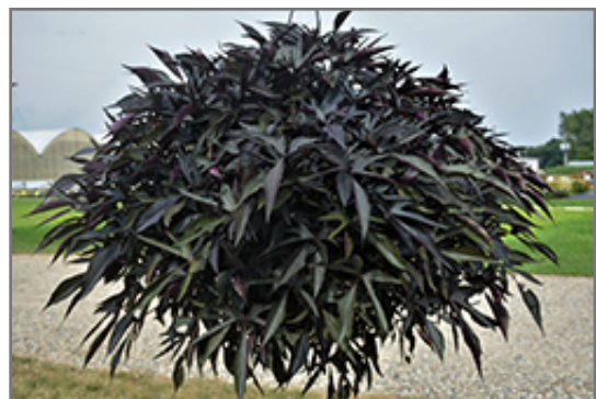
Illusion Midnight Lace Sweet Potato Vine