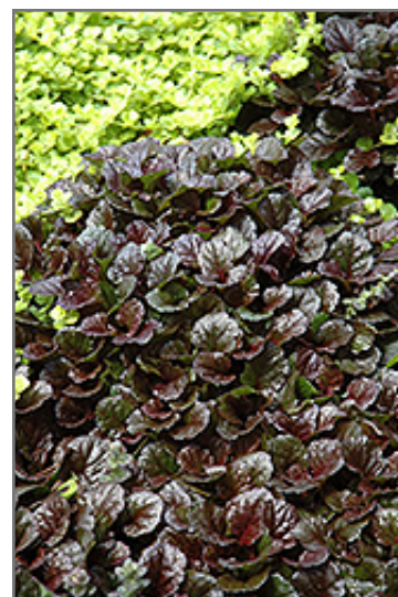
Black Scallop Bugleweed