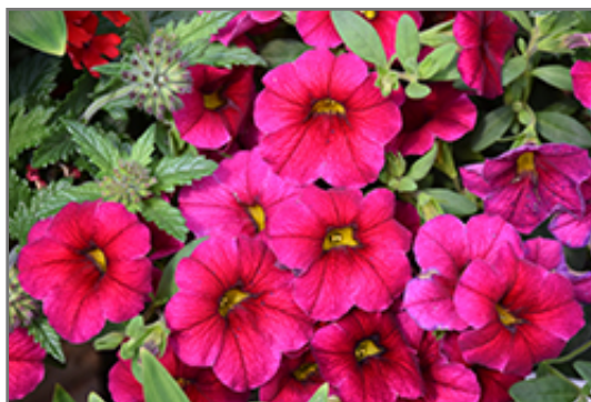
Superbells Cherry Red Calibrachoa flowers