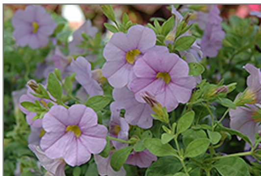
Superbells Miss Lilac Calibrachoa flowers

Superbells Miss Lilac Calibrachoa is recommended for the following landscape applications;