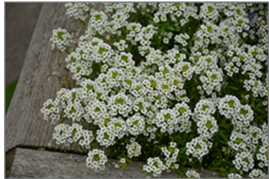
Snow Princess Alyssum flowers

Snow Princess Alyssum is recommended for the following landscape applications;