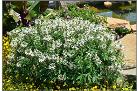
Senorita Blanca Spiderflower in bloom