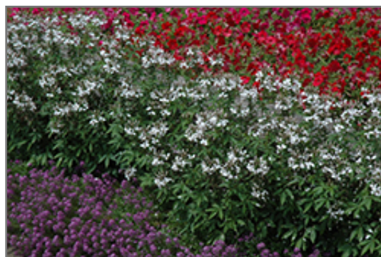
Senorita Blanca Spiderflower in bloom