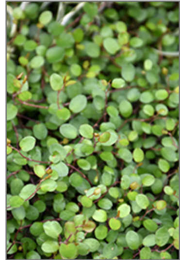
Creeping Wire Vine foliage