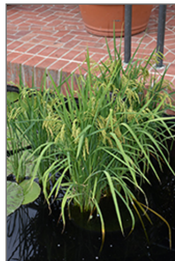
Asian Rice in bloom