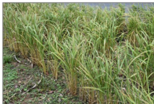
Asian Rice