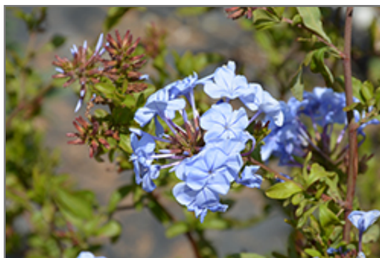
Imperial Blue Plumbago flowers

Imperial Blue Plumbago is recommended for the following landscape applications;