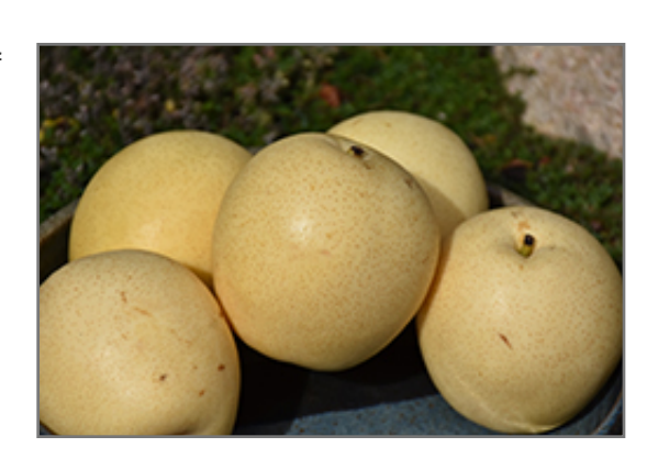
Shinseiki Asian Pear fruit

This tree is typically grown in a designated area of the yard because of its mature size and spread. It should only be grown in full sunlight. It does best in average to evenly moist conditions, but will not tolerate standing water. It is not particular as to soil type or pH. It is highly tolerant of urban pollution and will even thrive in inner city environments. This is a selected variety of a species not originally from North America.