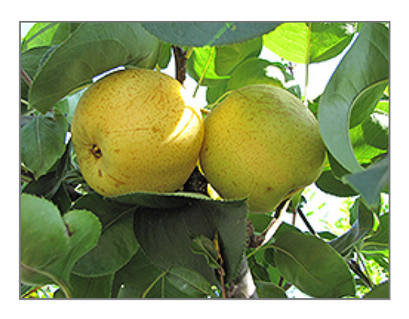
Shinseiki Asian Pear fruit

Shinseiki Asian Pear is clothed in stunning clusters of white flowers with pink anthers along the branches in early spring before the leaves. It has dark green deciduous foliage. The glossy pointy leaves turn an outstanding tomato-orange in the fall. The fruits are showy yellow pears carried in abundance in late summer. The fruit can be messy if allowed to drop on the lawn or walkways, and may require occasional clean-up.