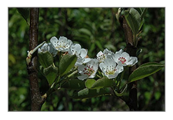
Shinseiki Asian Pear flowers