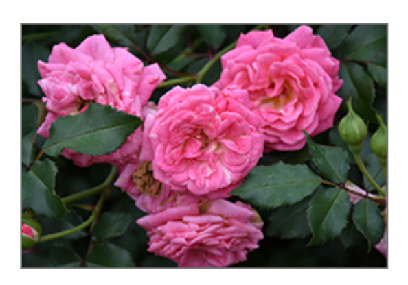
Sweet Drift Rose flowers

This shrub should only be grown in full sunlight. It does best in average to evenly moist conditions, but will not tolerate standing water. It is not particular as to soil type or pH. It is highly tolerant of urban pollution and will even thrive in inner city environments. This particular variety is an interspecific hybrid.