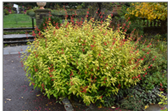
Golden Delicious Pineapple Sage in bloom