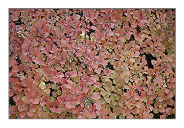
Dwarf Korean Lilac in fall

This shrub should only be grown in full sunlight. It is very adaptable to both dry and moist locations, and should do just fine under average home landscape conditions. It is not particular as to soil type or pH. It is highly tolerant of urban pollution and will even thrive in inner city environments. This is a selected variety of a species not originally from North America.