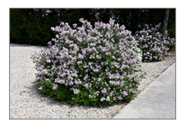
Dwarf Korean Lilac in bloom