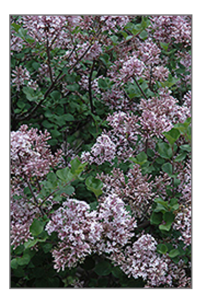
Dwarf Korean Lilac flowers

Dwarf Korean Lilac is recommended for the following landscape applications;