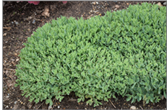
Rock 'N Round Pure Joy Stonecrop

Rock 'N Round Pure Joy Stonecrop is a fine choice for the garden, but it is also a good selection for planting in outdoor pots and containers. It is often used as a 'filler' in the 'spiller-thriller-filler' container combination, providing a mass of flowers and foliage against which the thriller plants stand out. Note that when growing plants in outdoor containers and baskets, they may require more frequent waterings than they would in the yard or garden.