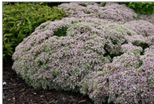
Rock 'N Round Pure Joy Stonecrop in bloom

This is a relatively low maintenance plant, and is best cleaned up in early spring before it resumes active growth for the season. It is a good choice for attracting bees and butterflies to your yard, but is not particularly attractive to deer who tend to leave it alone in favor of tastier treats. It has no significant negative characteristics.