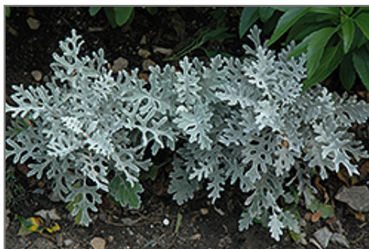
Silver Dust Dusty Miller foliage