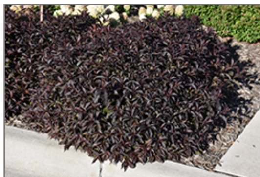
Spilled Wine Weigela