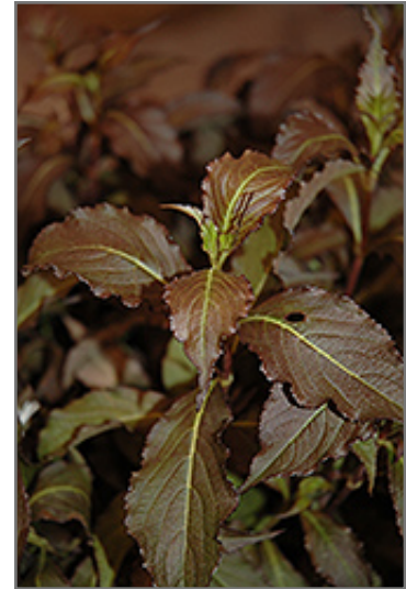
Spilled Wine Weigela foliage

Spilled Wine Weigela makes a fine choice for the outdoor landscape, but it is also well-suited for use in outdoor pots and containers. Because of its height, it is often used as a 'thriller' in the 'spiller-thriller-filler' container combination; plant it near the center of the pot, surrounded by smaller plants and those that spill over the edges. It is even sizeable enough that it can be grown alone in a suitable container. Note that when grown in a container, it may not perform exactly as indicated on the tag - this is to be expected. Also note that when growing plants in outdoor containers and baskets, they may require more frequent waterings than they would in the yard or garden.