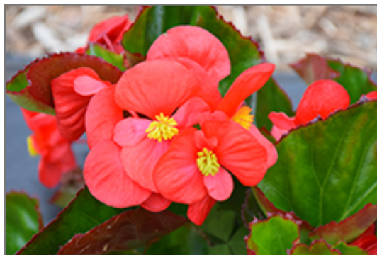
Big Red Green Leaf Begonia flowers

This is a high maintenance plant that will require regular care and upkeep, and usually looks its best without pruning, although it will tolerate pruning. Deer don't particularly care for this plant and will usually leave it alone in favor of tastier treats. Gardeners should be aware of the following characteristic(s) that may warrant special consideration;