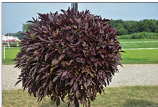
Illusion Garnet Lace Sweet Potato Vine