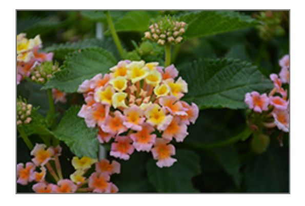
Bandana Peach Lantana flowers

Bandana Peach Lantana is recommended for the following landscape applications;