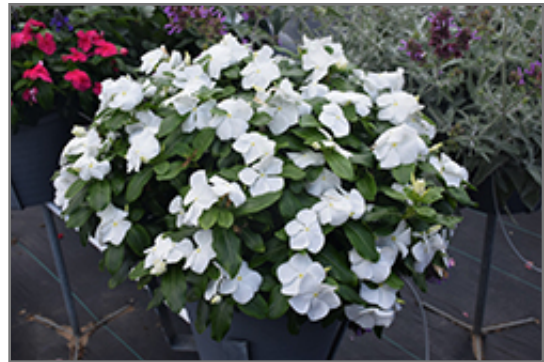
Titan Pure White Vinca in bloom

Titan Pure White Vinca will grow to be about 14 inches tall at maturity, with a spread of 12 inches. Its foliage tends to remain dense right to the ground, not requiring facer plants in front. Although it's not a true annual, this fast-growing plant can be expected to behave as an annual in our climate if left outdoors over the winter, usually needing replacement the following year. As such, gardeners should take into consideration that it will perform differently than it would in its native habitat.