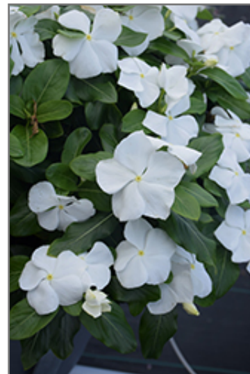
Titan Pure White Vinca flowers

Titan Pure White Vinca is recommended for the following landscape applications;