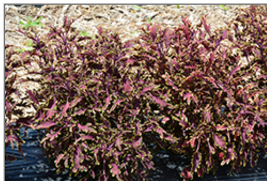
Stained Glassworks Kiwi Fern Coleus