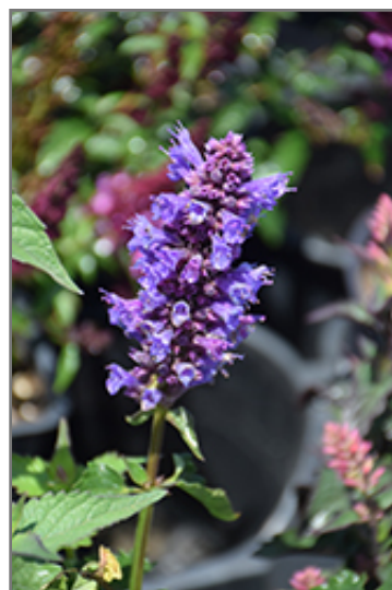
Blue Boa Hyssop flowers