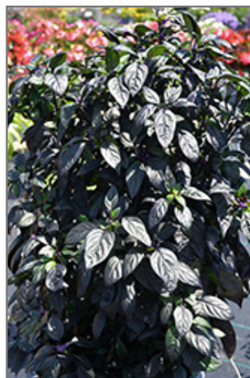
Black Pearl Ornamental Pepper