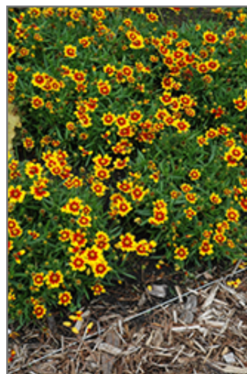
Lil' Bang Daybreak Tickseed in bloom