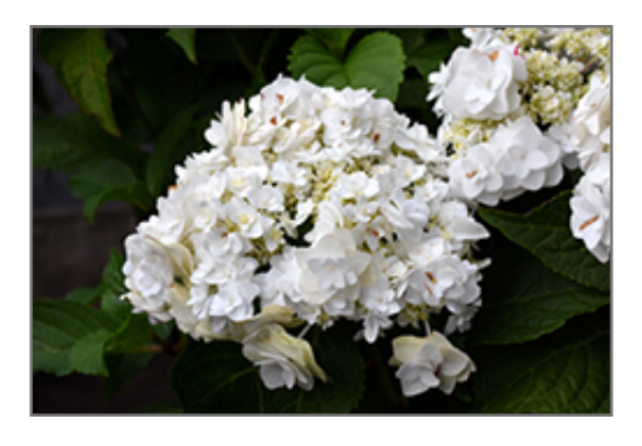
Wedding Gown Hydrangea flowers

This shrub will require occasional maintenance and upkeep, and should only be pruned after flowering to avoid removing any of the current season's flowers. It has no significant negative characteristics.