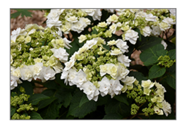
Wedding Gown Hydrangea flowers

Wedding Gown Hydrangea is a multi-stemmed deciduous shrub with a mounded form. Its relatively coarse texture can be used to stand it apart from other landscape plants with finer foliage.