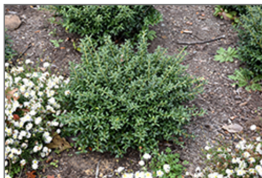
Soft Touch Japanese Holly