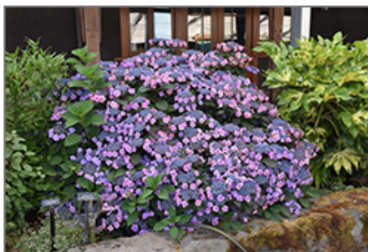
Tuff Stuff Hydrangea in bloom