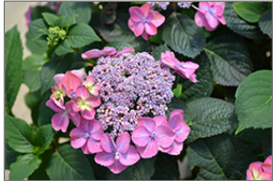
Tuff Stuff Hydrangea flowers

Tuff Stuff Hydrangea makes a fine choice for the outdoor landscape, but it is also well-suited for use in outdoor pots and containers. With its upright habit of growth, it is best suited for use as a 'thriller' in the 'spiller-thriller-filler' container combination; plant it near the center of the pot, surrounded by smaller plants and those that spill over the edges. It is even sizeable enough that it can be grown alone in a suitable container. Note that when grown in a container, it may not perform exactly as indicated on the tag - this is to be expected. Also note that when growing plants in outdoor containers and baskets, they may require more frequent waterings than they would in the yard or garden.