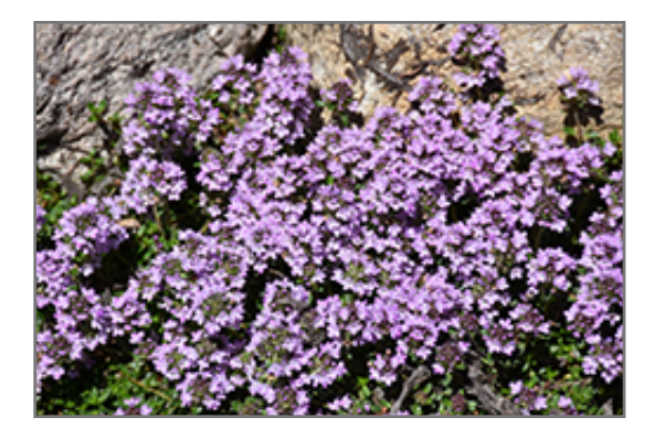
Purple Carpet Creeping Thyme flowers

This plant will require occasional maintenance and upkeep, and is best cleaned up in early spring before it resumes active growth for the season. Deer don't particularly care for this plant and will usually leave it alone in favor of tastier treats. Gardeners should be aware of the following characteristic(s) that may warrant special consideration;