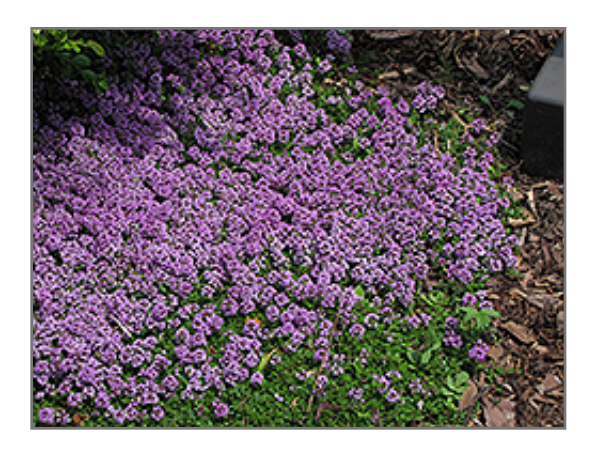
Purple Carpet Creeping Thyme in bloom