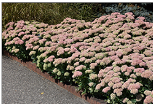
Autumn Joy Stonecrop in bloom

Autumn Joy Stonecrop is recommended for the following landscape applications;