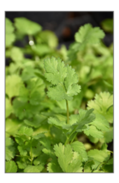
Cilantro foliage

This plant is typically grown in a designated herb garden. It does best in full sun to partial shade. It does best in average to evenly moist conditions, but will not tolerate standing water. It is not particular as to soil pH, but grows best in rich soils. It is somewhat tolerant of urban pollution. This species is not originally from North America.