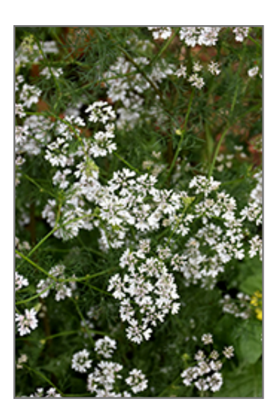
Cilantro flowers