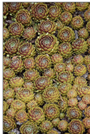
Piloseum Hens And Chicks