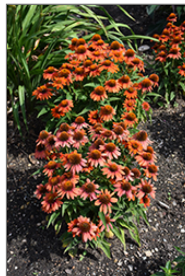
Sombrero Adobe Orange Coneflower in bloom